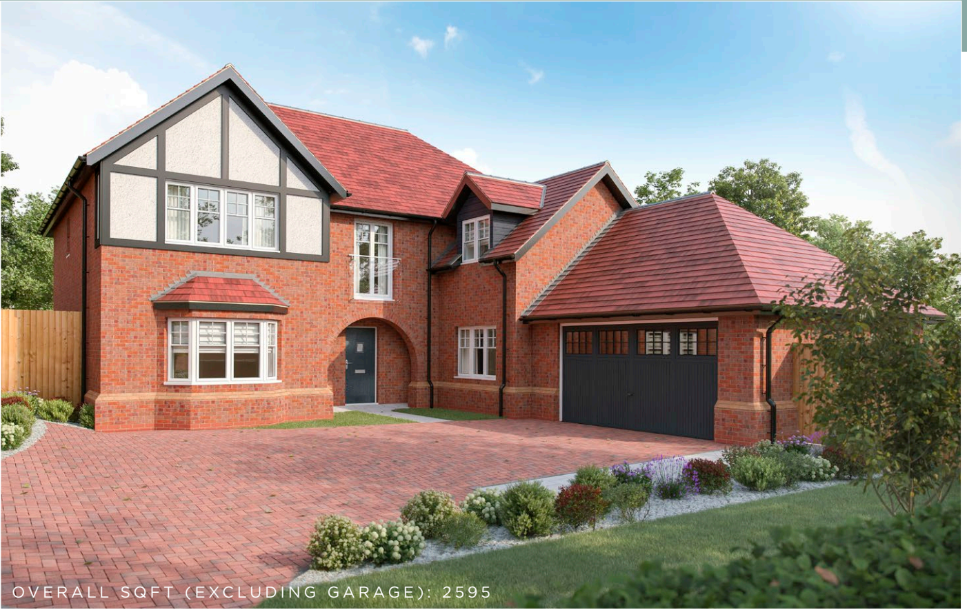
OVERALL SQFT (EXCLUDING GARAGE): 2595